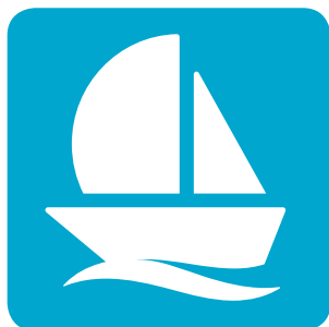
IH Palma, Mallorca